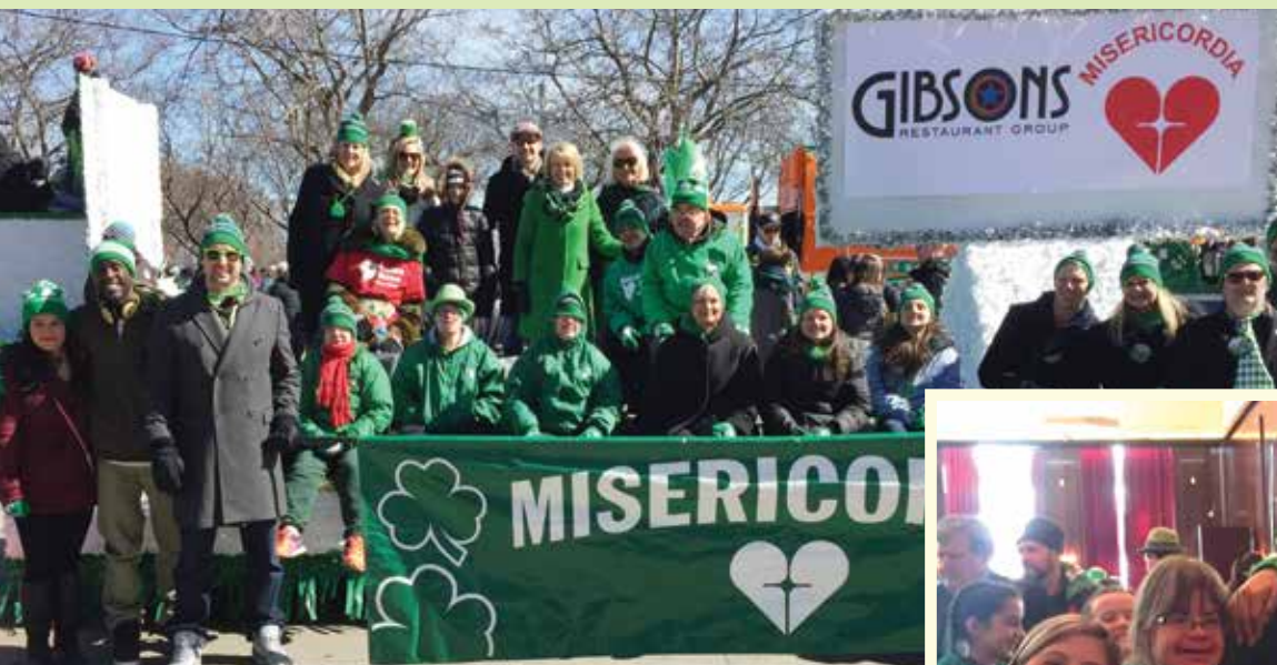
Left: Residents and friends celebrated Saint Patrick's Day on the Misericordia float during the downtown parade.