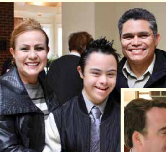
Families of the Misericordia Outreach program enjoy the annual luncheon and mass.

with an annual luncheon and mass in April. Misericordia's Outreach Program is dedicated to providing support and activities to children, teens and adults who are living at home with their families. Programs include play groups, a tweens group, summer camp and adult outreach through our Developmental Training Department.